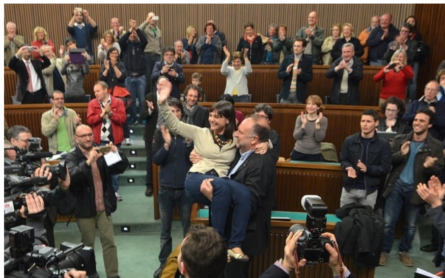
Figure 2: Cosolini carries Serracchiani again after her election as governor of Friuli Venezia Giulia in April 2013. The original caption emphasizes that the “sollevamento della sposa” (lifting of the bride) received a “standing ovation” from the audience. The article’s title condescendingly calls Serracchiani by name: “L’ingresso trionfale di Debora in Consiglio regionale a Trieste” (Debora’s triumphant entrance in the regional Council in Trieste).

party member Roberto Cosolini following their electoral wins: Cosolini was elected mayor of Trieste in 2011 and Serracchiani governor of Friuli Venezia Giulia region in 2013 (figures 1 and 2). 16