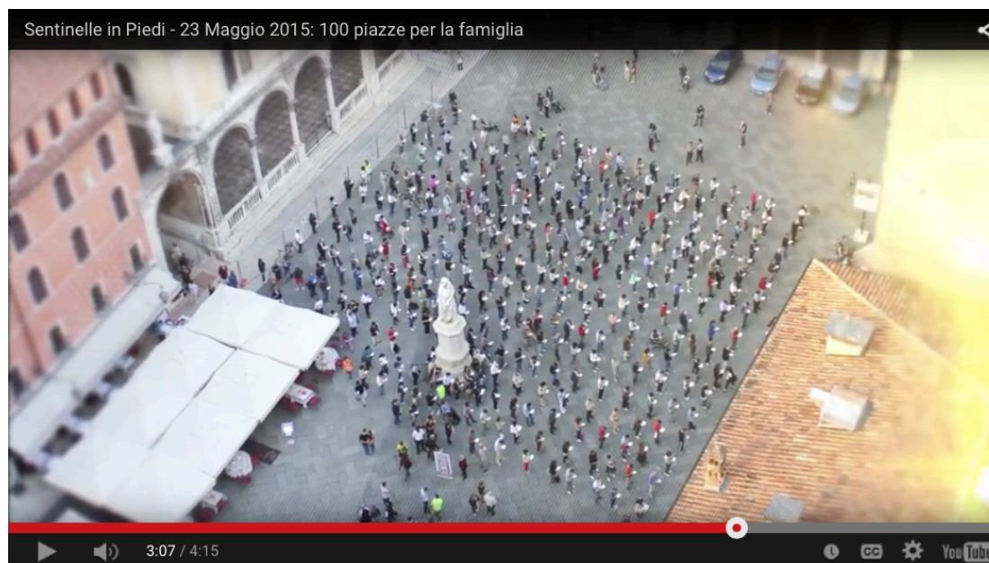
Figure 3: A snapshot from the promotional video of sentinelle in piedi , showing their military arrangement in one of the veglie .

del gender, un passo indietro,” Avvenire.it , April 15, 2015, http://www.avvenire.it/Chiesa/Pagine/udiensa-papa-famiglia-matrimonio.aspx , accessed June 25, 2015. The quote about the “ideological colonization” that the teoria del gender is allegedly performing on children is an extract from a speech that the Pope gave on January 19, 2015. For the full transcript, see http://it.radiovaticana.va/news/2015/01/19/papa_aereo_trascrizione_integrale_del_testo/1119009 , accessed June 25, 2015. For a quick overview of how the “teoria del gender” is currently discussed in Italy, see Giulia Siviero, “Che cos’è la ‘teoria del gender,’” April 16, 2015, Ilpost.it , available at http://www.ilpost.it/2015/04/16/teoria-del-genero-gender-theory , accessed June 25, 2015.